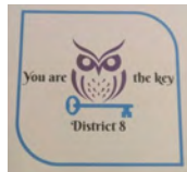
2026-2027 District 8 Logo